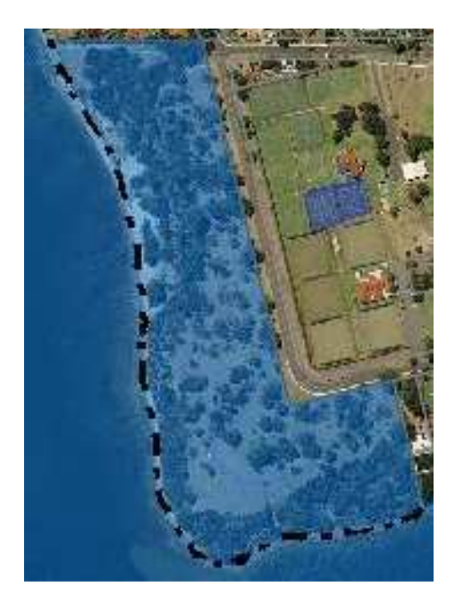
Figure 5: Swan River Trust Development Control Area Point Resolution

The bushland at Point Resolution covers an area of approximately 4Ha. Point Resolution is vested in the City of Nedlands as A Class Reserve 17391 for "Parks and Recreation". The City of Nedlands has the "Power to Lease" on Reserve 17391. Like Birdwood Parade, Point Resolution also falls within the Swan River Trust's DCA. The Swan River Trust provides advice, considers and makes recommendations on development and land use applications that affect the DCA.