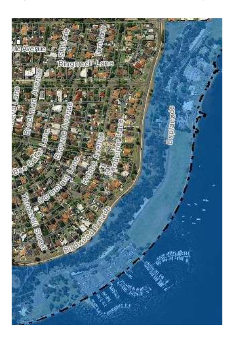
Figure 4: Swan River Trust Development Control Area Birdwood Parade.

The Bushland at Birdwood Parade covers an area of approximately 5.7Ha. Birdwood Parade is vested in the City of Nedlands as A Class Reserve 1624 for "Parks and Recreation". Currently, the City of Nedlands has the "Power to Lease" on Reserve 1624. Birdwood Parade falls within the Swan River Trust's Development Control Area (DCA). The Swan River Trust provides advice, considers and makes recommendations on development and land use applications that affect the DCA.