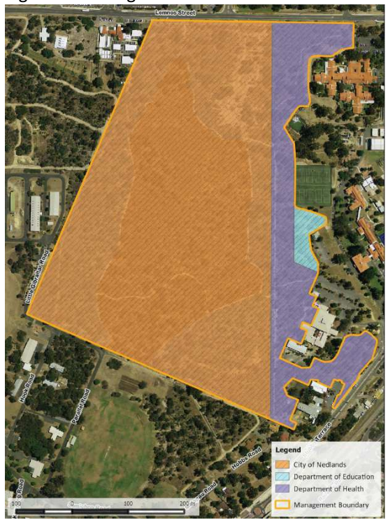
Figure 2: Vesting Shenton Bushland

Shenton Bushland also contains C Class Reserve 20074 which is vested with the Department of Health for "Health Purposes". Reserve 20074 covers an area of approximately 9Ha of which 4.8Ha consists of bushland. The 4.8Ha of bushland is cooperatively managed between the City of Nedlands, the Friends of Shenton Bushland and the Department of Health. A Memorandum of Understanding (MOU) between the City and the Department of Health outlines the Department of Health's contribution towards natural area management on Reserve 20074 for 2013 – 2017. A small area (0.4Ha) is also owned by the Department of Education on the eastern edge of the bushland.