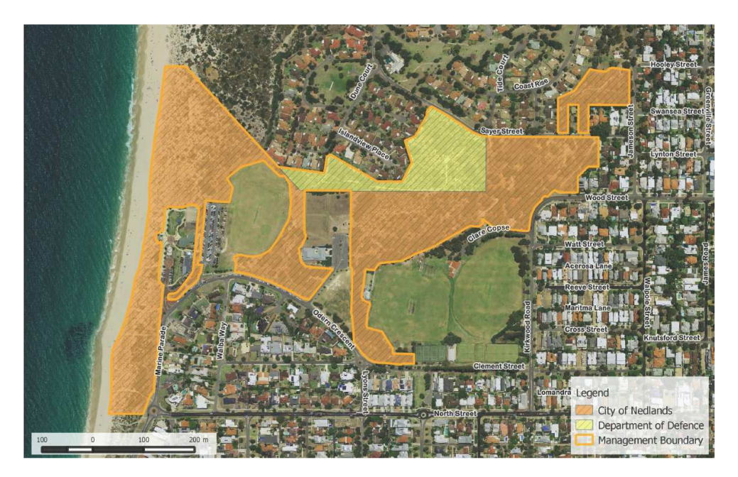
Figure 3: Land Ownership and Vesting Allen Park Bushland