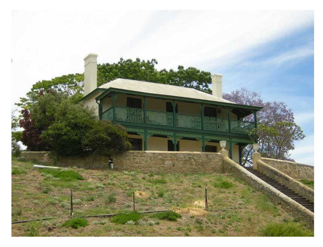
Figure 11: Gallop House, as it stands today

The stone building was constructed in the 1870s by James Gallop and is now registered with the State Register of Heritage Places and National Heritage Trust. It is significant through its association with the families instrumental in the development of Dalkeith and its strong association with farming in the early European settlement of the Swan River (Australian Heritage Commission, cited in Ecoscape 2003).