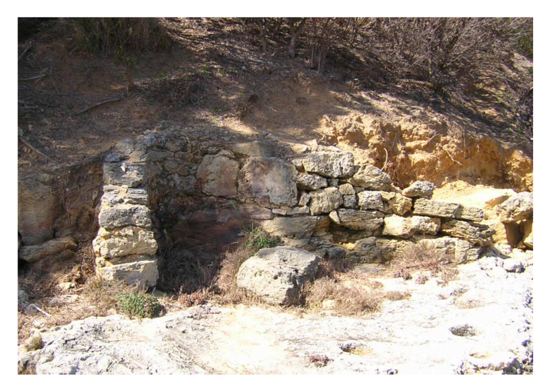
Figure 10: Remains of Barbeque at Point Resolution

The stones for the barbeque probably came from the cottage or shed near the quarry. A fishermen's cottage also existed just west of the present building line in Jutland Parade as late as 1948 (Anderson, cited in Ecoscape 2003).