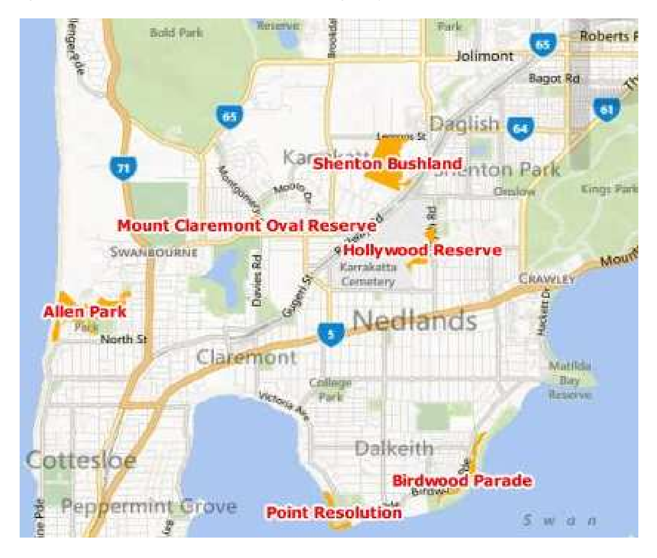
Figure 1: Location of Natural Areas within Nedlands (Google Maps 2013)

The City's natural areas provide a variety of environmental, social, recreational and cultural values for the local and wider community.