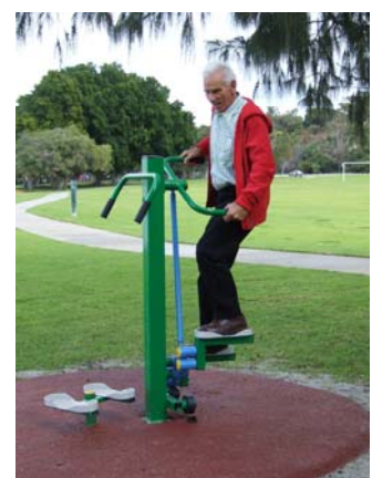
Foreshore exercise equipment

In 2009, the City received a Local Activity Grant of $10,000 from the Physical Activity Taskforce, WALGA and Lotterywest. The City matched this grant in order to carry out the Be Active in Nedlands project in the 2009 calendar year. As a part of this project walking groups have been established in the City along with the installation of four items of outdoor exercise equipment on the Nedlands Foreshore. Still to come is a Be Active in Nedlands newsletter, a Be Active section on the City's website and walking maps for popular walking trails.