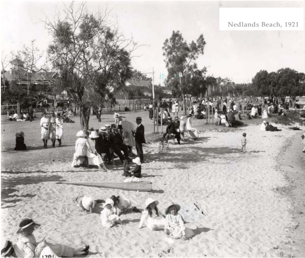
Nedlands Beach, 1921