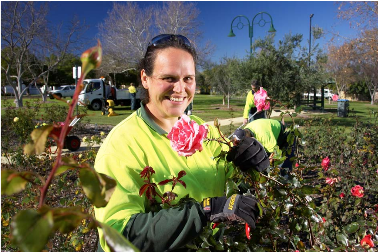
Pruning works at the Peace Memorial Rose Gardens

The turnover rate of the City’s employees slowed this year to 17.4%.