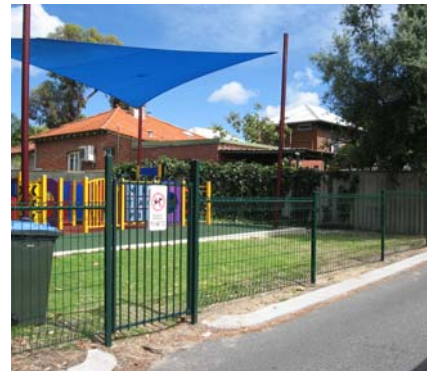
Leura Park playground

The City's Engineering Services has improved the City's road and footpath infrastructure networks by providing 2,862m of road rehabilitation, 3,216m of road resurfacing, 420m of new footpaths and 6,041m of rehabilitated footpaths during 2008/09 financial year.