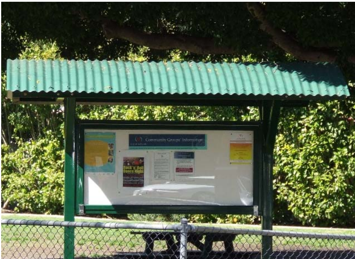
Community Information Bays are located in Allen Park, Lawler Park, College Park and Carrington Park to display Council and Community information.