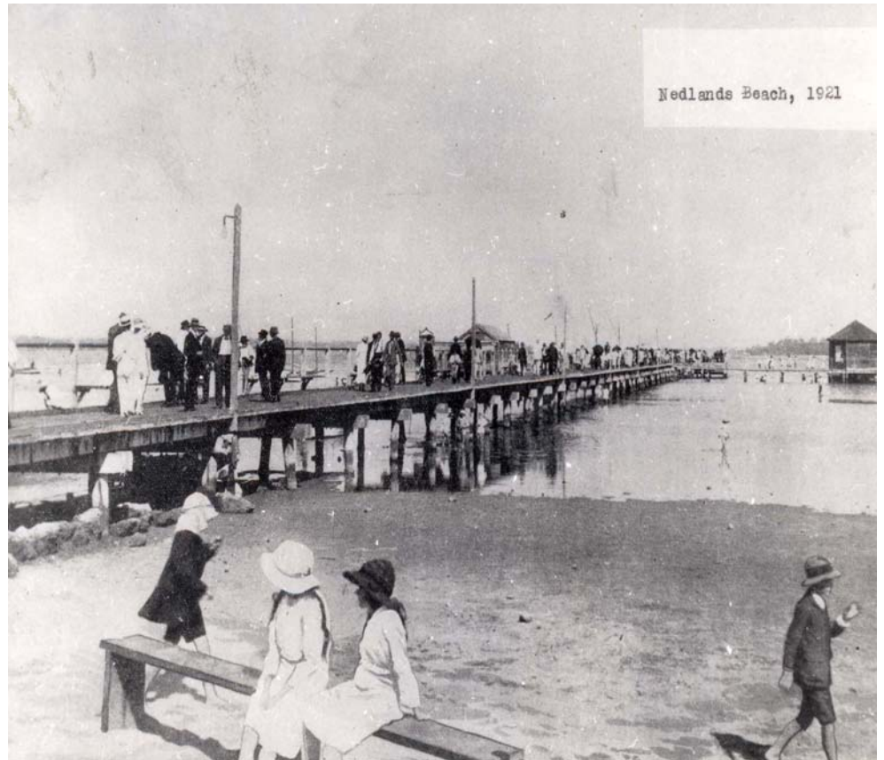
Nedlands Beach, 1921