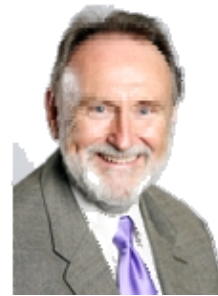
Cr Hipkins (2009)