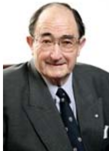
Cr Argyle (2011)