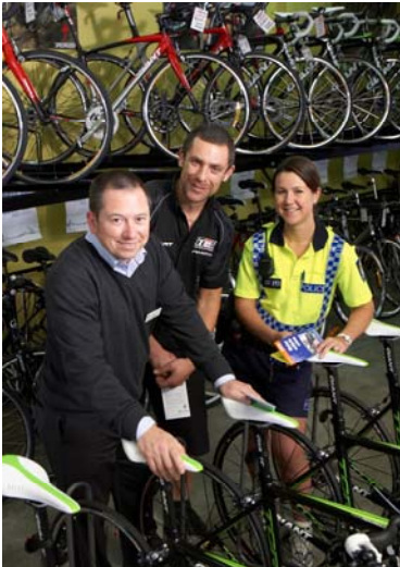
Business Beat at TBE, Nedlands.

The City's graffiti removal service aims to reduce the visual impact of graffiti and discourage graffiti by prompt removal. The City continued to provide a 24 hour telephone graffiti reporting service as well as a link to the State Government's Goodbye Graffiti website, so that graffiti incidents could be reported automatically for prompt removal. The City spent over $40,000 on the removal of graffiti during 2008/09.