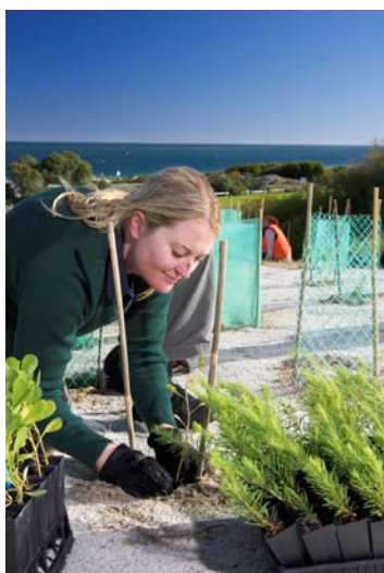
Planting on Swanbourne dunes

The Bushcare program for 2008/09 involved ongoing implementation of the City of Nedlands Natural Area management plans. This involved carrying out activities such as control of priority weed species (using a combination of physical, chemical and biological controls); implementing erosion control measures; revegetation of degraded bushland areas, fire management and feral animal control in the City's bushland reserves with the aim of conserving and enhancing biodiversity.