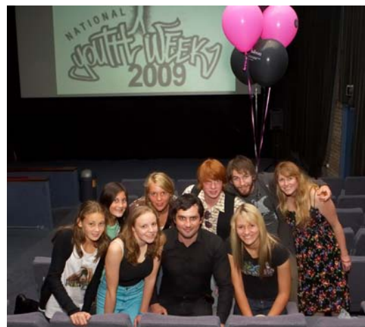
Black Balloon film night at the Windsor Theatre

In 2008/09, the City provided a wide range of activities for local young people, including; National Youth Week Festival event, Cyber Safe session, Youth Skate workshops, Intergenerational Bowls night and the City's annual urban art project. Other activities for local children and young people were provided through the City' libraries, at Tresillian Community Centre and through programs such as the Nedlands Volunteer Services, Bush Care and TravelSmart.