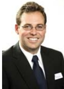
Cr Negus (2011)