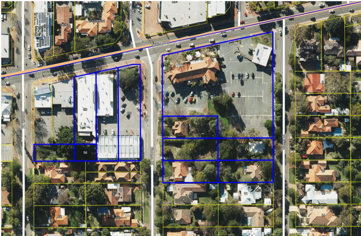
Figure 1: Properties to the south of Stirling Highway between Dalkeith Road and Stanley Street subject to proposed laneway development

4.1.1 A laneway shall be provided on the land identified in Figure 1 and Figure 2.